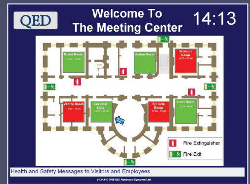
Room Booking Touch Screen