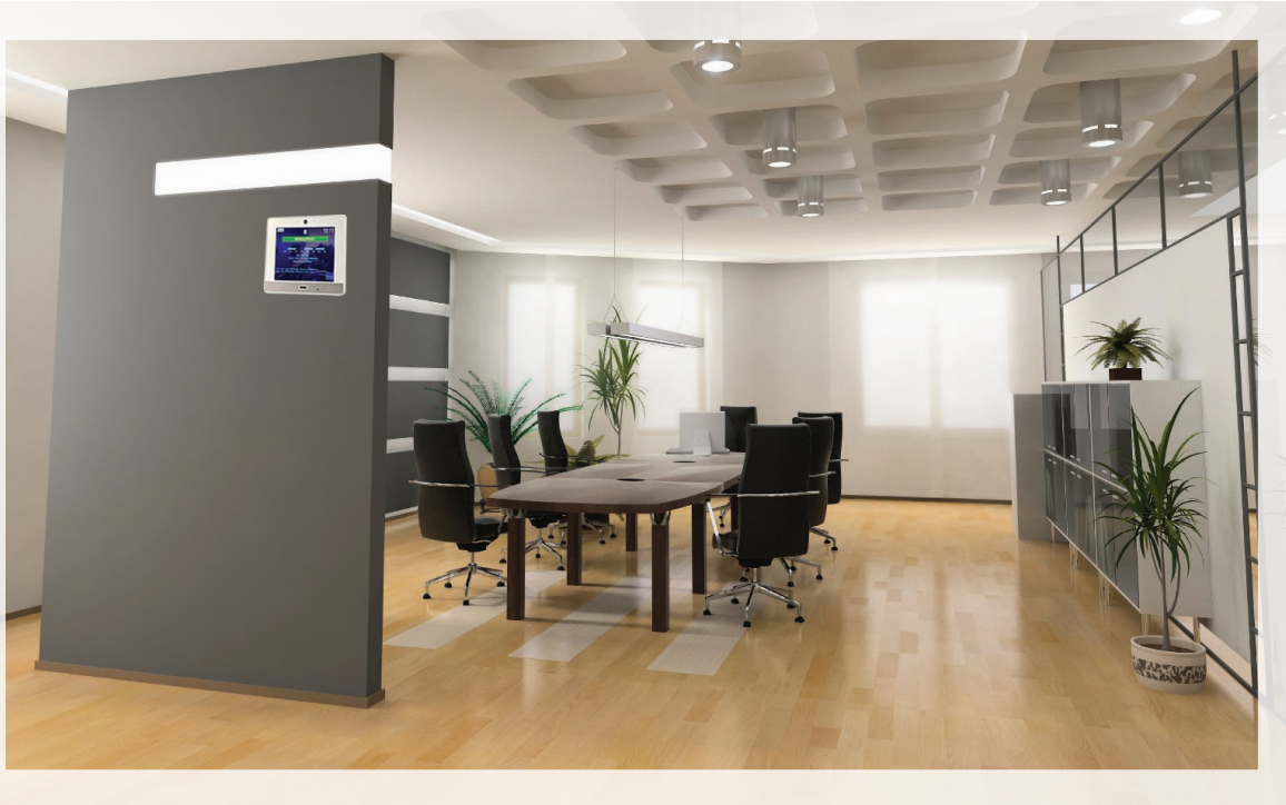
Floor Plan Kiosk for Room Booking

The room and kiosk screens are easy to operate, fully customisable and include facilities to create instant bookings, check-in/check-out, and extend reservations