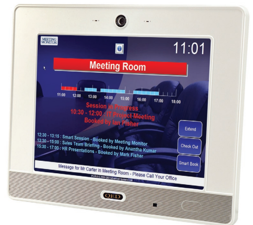
Wi-Fi Room Screens available in white, black and grey

Meeting Monitor is a future proofed solution that with the choice of desktop booking systems, customisation options and choice of industry standard hardware will adapt, expand and evolve with changing organisational requirements.